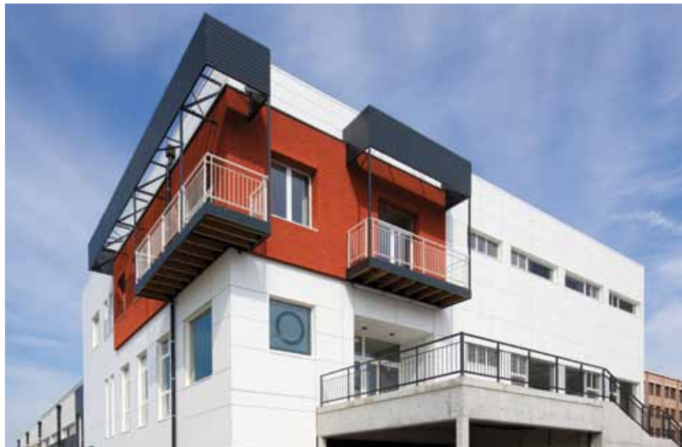
Sports centre | Architect: ULB Erasme | Colour: Calico