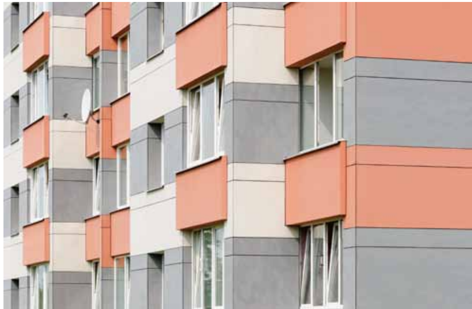
Apartment block | Architect: JSC Panprojektas | Colours: Linen, Pebble, Sahara